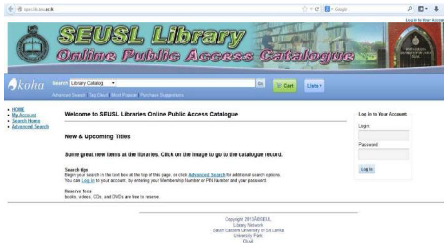
Figure 2: OPAC of the SEUSL library of the KOHA version 3.6.

The SEUSL library has moved to KOHA version 3.6 in July 2013. Figure 2 shows the OPAC of the SEUSL library of the KOHA version 3.6. KOHA version 3.6 backend database structure differs from KOHA version 2.2.8 backend database structure. MySQL versions also differ from the KOHA version 2.2.8. Therefore, the data in KOHA version 2.2.8 was modified to match with KOHA version 3.6. In addition to item types in KOHA version 2.2.8 Collection code, Shelving location and authorize value were introduced. The backend data in KOHA version 2.2.8 has been cooked to match the KOHA version 3.6. It was a difficult task to convert data into KOHA version 3.6 since the database had non-Latin characters.