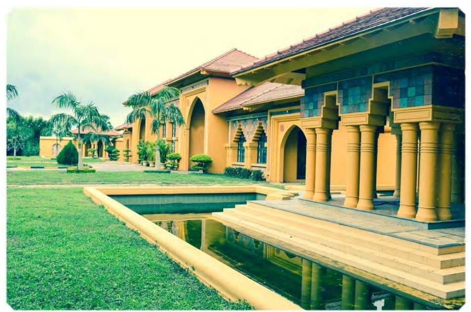
Faculty of Engineering and Faculty of Technology. All faculties except the Faculty of Applies Sciences which is located in Sammanthurai, are located in Oluvil premises.

South Eastern University of Sri Lanka (SEUSL) was first established as the South Eastern University College of Sri Lanka and commenced to function from 27<sup>th</sup> July 1995 with 33 students. It was then upgraded to the status of a fully-fledged University, SEUSL, from 15<sup>th</sup> May 1996. There are six faculties in SEUSL at present, namely Faculty of Arts and Culture, Faculty of Management and Commerce, Faculty of Applies Sciences, Faculty of Islamic Studies & Arabic Language,